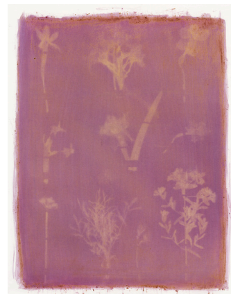
Black Currant – Herbarium Plate 57, 2023 Size 30 x 40"