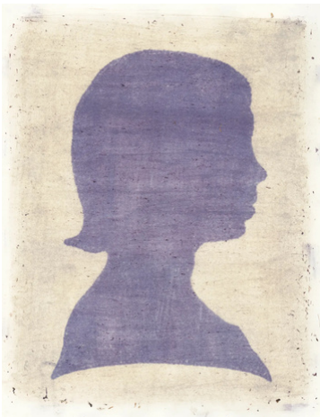
Left: Anthotype created with red lily (Hemerocallis), depicting Emily Dickinson's profile at age 14. Based on an original drawing by Charles Temple (1845). Negative. Size 16.5 x 21". Right: a page from Dickinson's original herbarium.

"In a gesture honoring Dickinson's nearly 200 year-old effort, we grew and harvested plants to remake her flower sampler with an alternative photo-process known as anthotype. Antho means flower in Greek. Anthotypes are plant-based photographs, a process dating back to when Dickinson was at work on her herbarium."